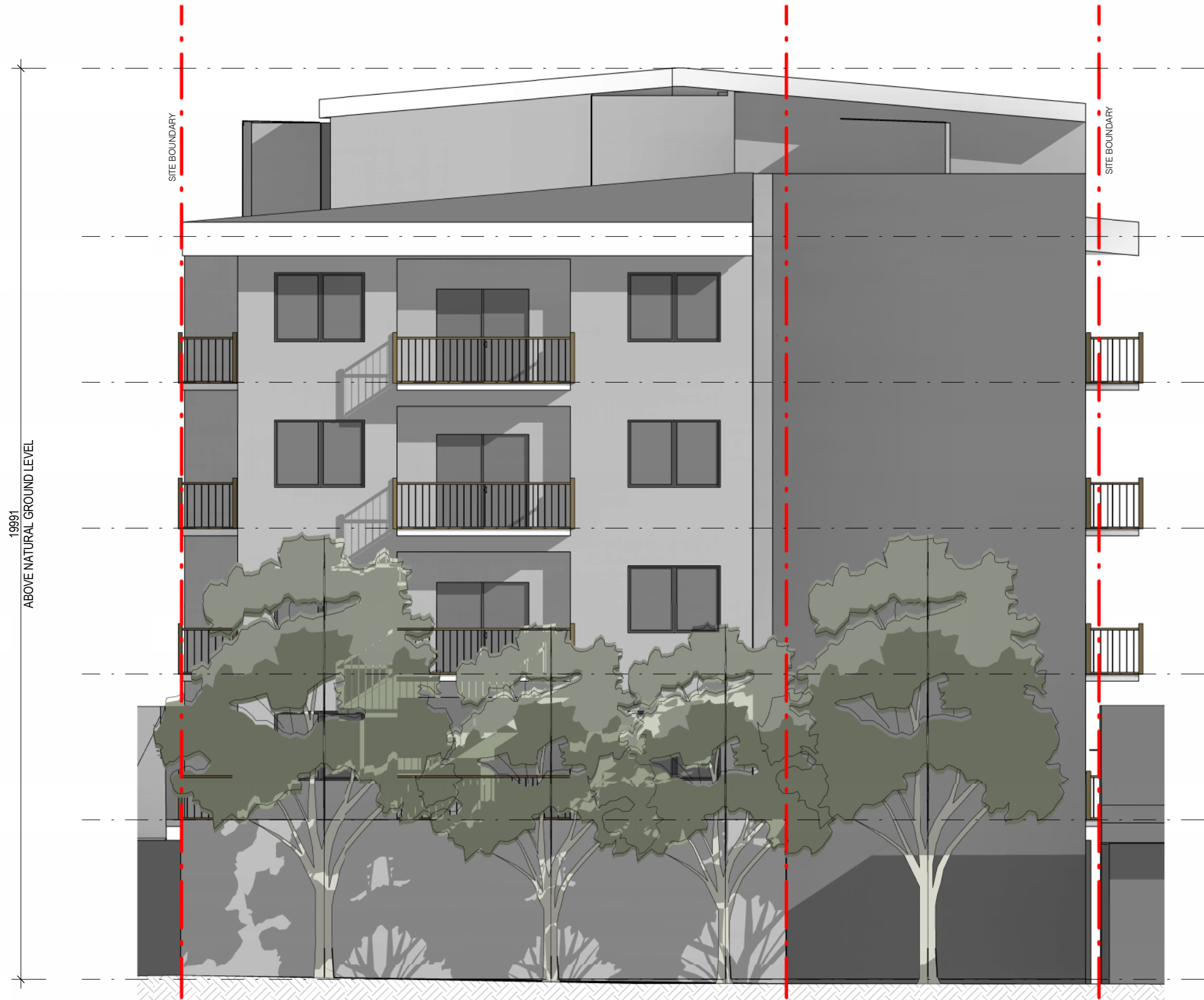
WEST ELEVATION - PROPOSED APARTMENT DEVELOPMENT 1:100

no. date ISSUE / revision by A 09.03.16 PLANNING PROPOSAL SUBMISSION RB/TB B 16.03.16 PLANNING PROPOSAL SUBMISSION - SET BACK DIMENSIONS ADDED RB/TB